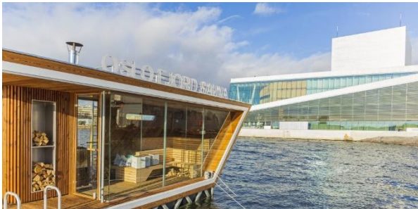
We'll start in Oslo, where the Opera Hall provides a beautiful background to the floating saunas in the harbor.