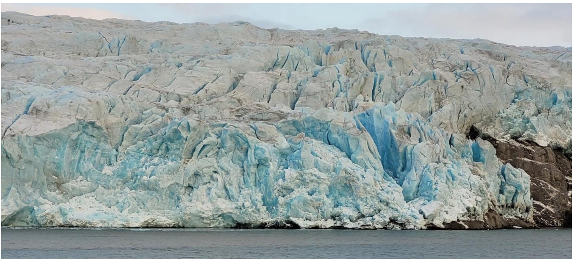
Glaciers flowing into the fjord outside of Longyearbyen

Option 2 - For those who love trains and want to see more of the mainland of Norway, there will be an optional add-on. Where we go will be determined separately with those who are interested.