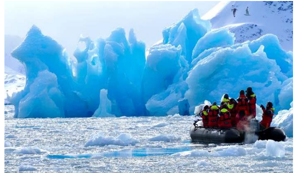
We have a choice of two ships — If you're seriously considering joining us, read on and help us decide.