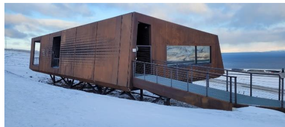
Global Seed Bank – Longyearbyen

May 25 (Day 4): Afternoon hike including the area of the Global Seed Vault. The Seed Vault safeguards more than 1.2 million types of seeds from almost every country in the world, with room for millions more. Its purpose is to provide a backup gene bank collection to secure the foundation of our future food supply. The seeds are in deep storage using a former coal mine.