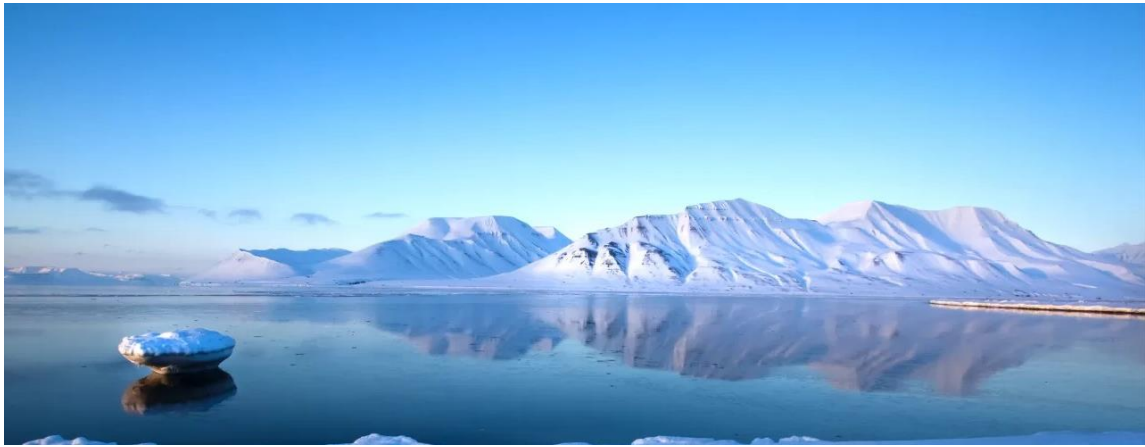
Late spring, when the sea ice is melting and the polar bears are emerging

Explore Oslo, Norway and then Cruise the Svalbard Archipelago on a small ship