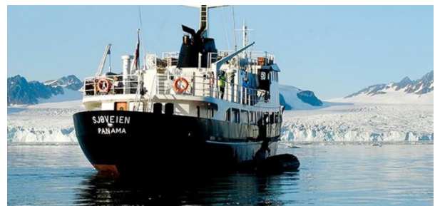
M/S Sjøveien - 12 passengers