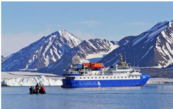
M/S Quest - 50 passengers