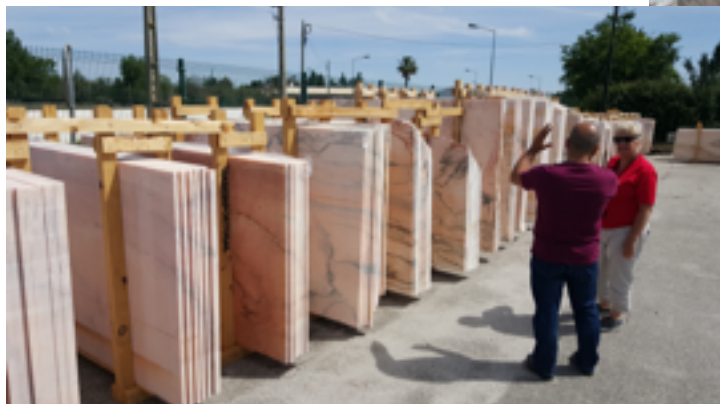
Marble from the quarry