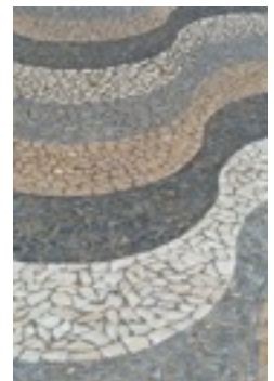
Evora, Uniseco World Heritage