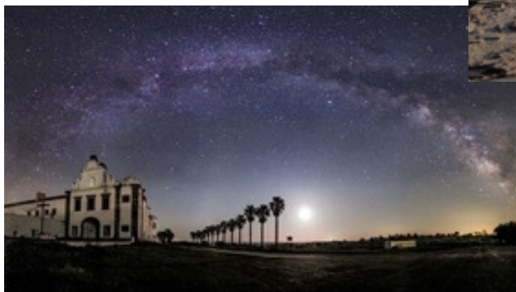
Alqueva Dark Sky Reserve, some of the brightest, clearest skies on earth